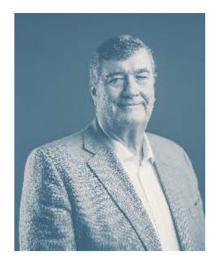
Appointed Director on 3 December 1991 Member of the Corporate Governance, Ethics, Nomination & Remuneration Committee until 12 September 2024

Core competencies: Strategy and corporate finance, building business partnership, international development, new business opportunities.